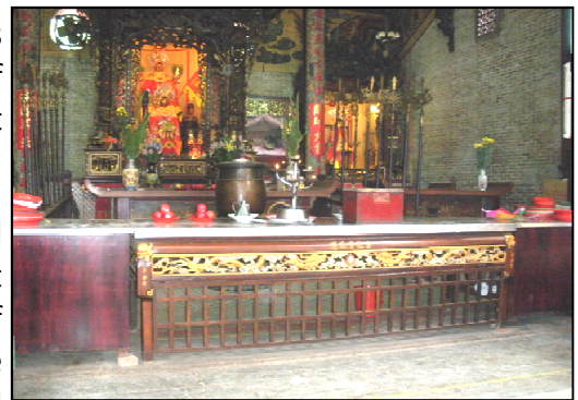
Picture of the altar in the Buddhist Temple.

The incense was then hung from the ceiling, and lit from the bottom. The incense burns slowly dropping ashes on the temple floor. Our guide told us that Buddhists believe that when the lit section of the incense reaches the prayer, that their prayer will be heard.