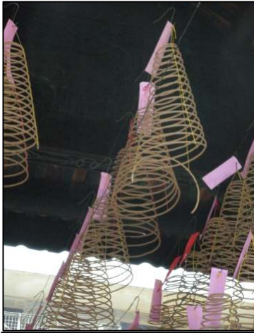
Hanging incense with pink prayer tags.

In May, I travelled to Ho Chi Minh City, Vietnam and Shanghai, China as part of my coursework in my executive MBA program at Kent State University. When I travel, I try to attend services at the nearest